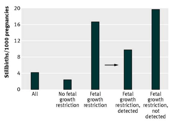
Fig 1 Stillbirth rates in relation to fetal growth restriction and whether it was detected antenatally