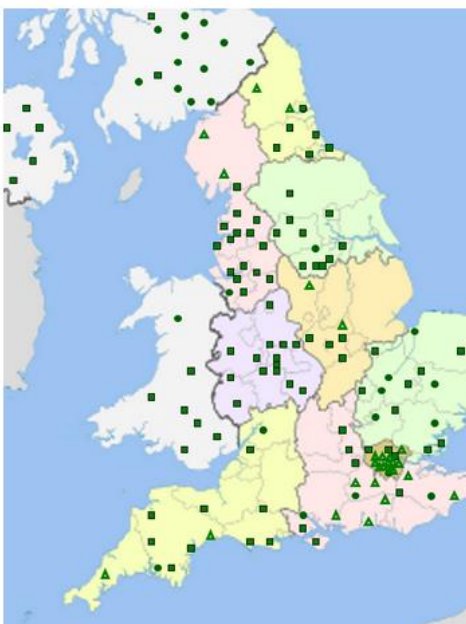
Trusts & Health Boards in England, Wales, Scotland & Northern Ireland (n=168)